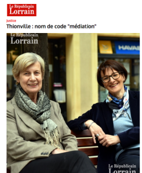
Article in "Le Républicain Lorrain" (in French)